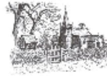
All Saints' Kingston Seymour