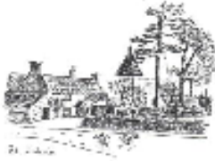
St John's Kenn